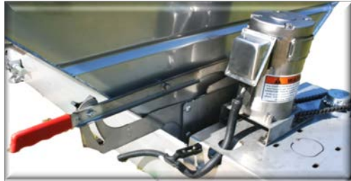
Stainless steel motor casing.

Low profile, 26" height, for better rearward visibility, in smaller trucks.