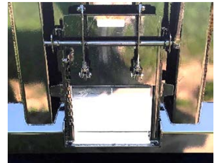
Optional Coal chute / inspection door