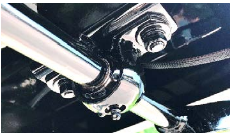
Greasable latch bearings